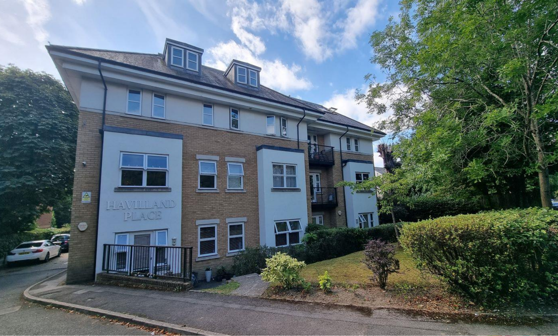
Havilland Place Linkfield Lane, Redhill RH1 1JF