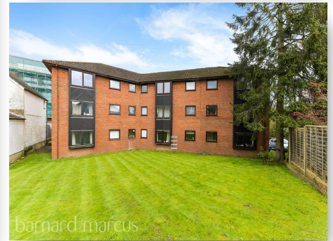
The Willows Brook Road, Redhill RH1 6RZ