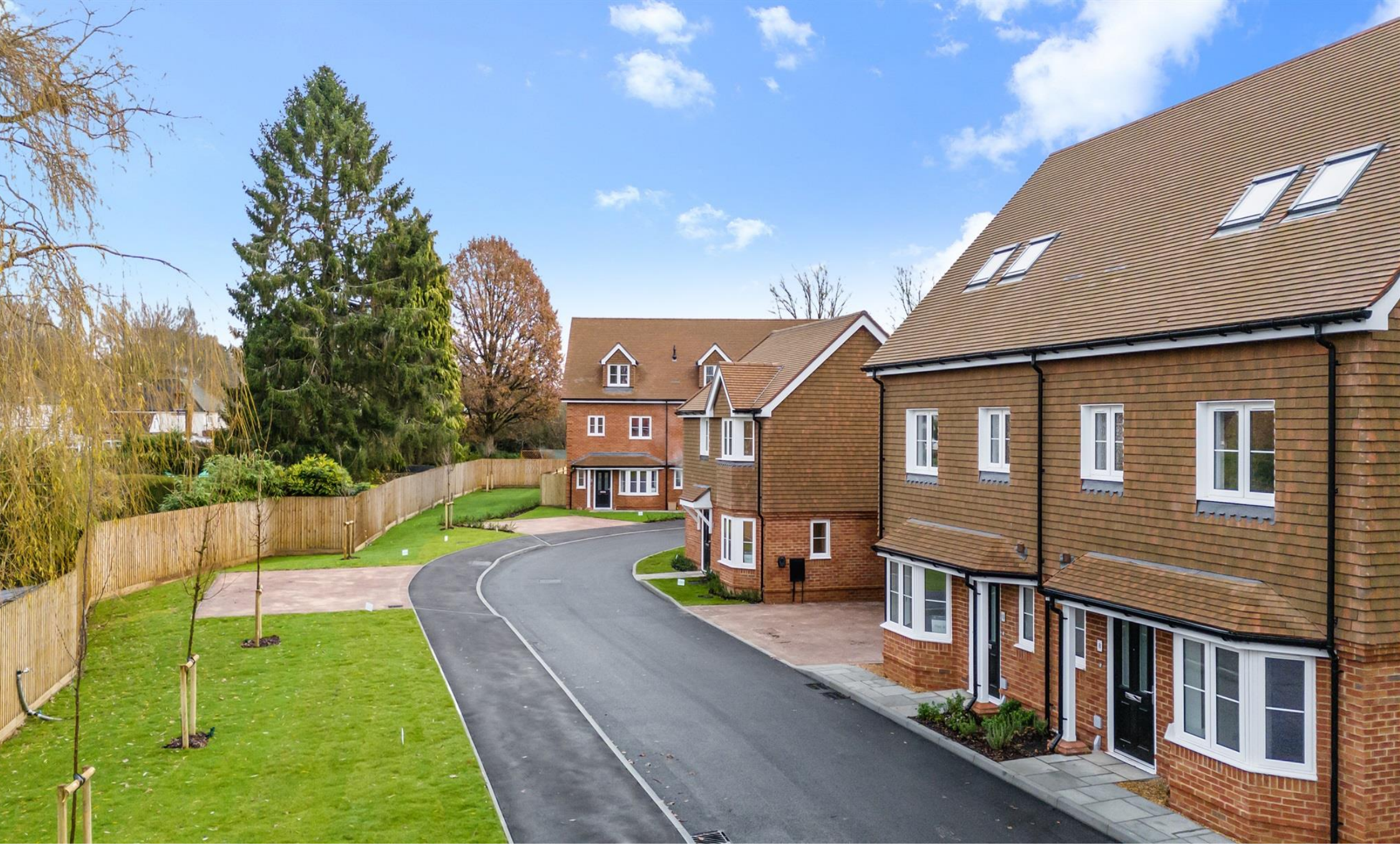
Evelyn Gardens, Felbridge East Grinstead RH19 2NT