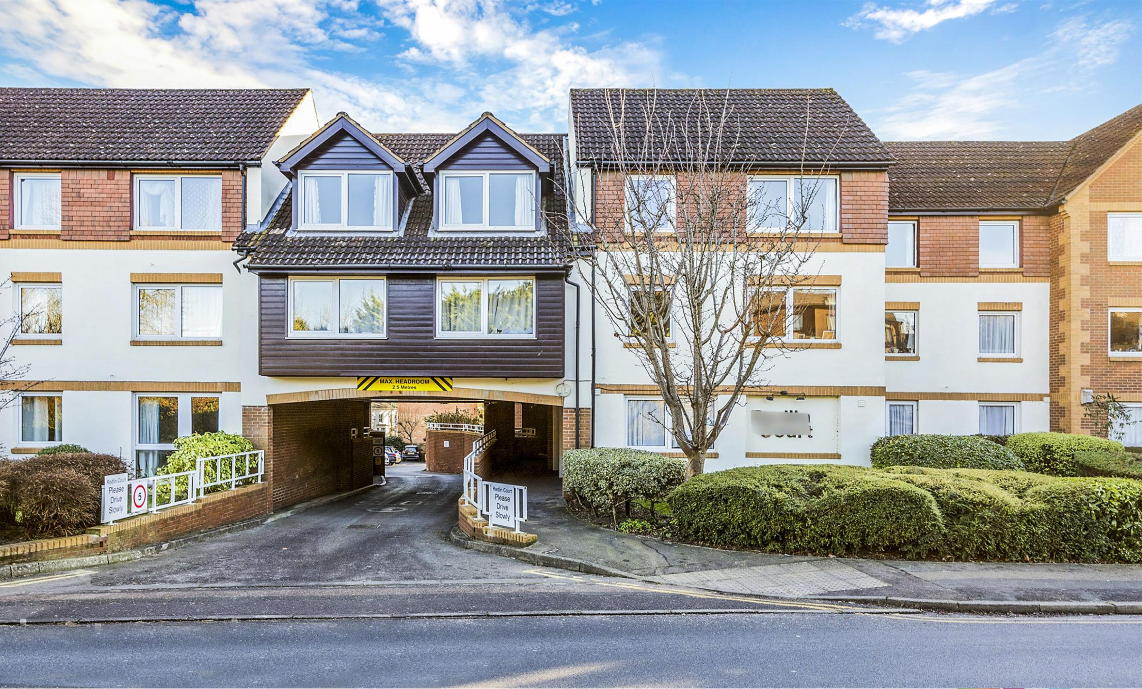
Redlin Court Linkfield Lane, Redhill RH1 1TB