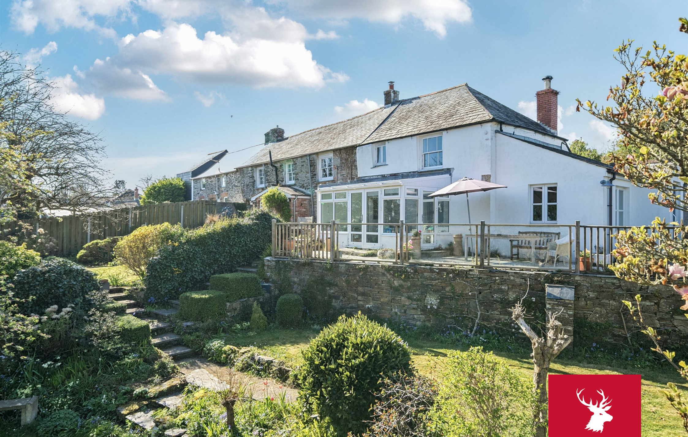
Marsh Cottage & Sweeney Cottage