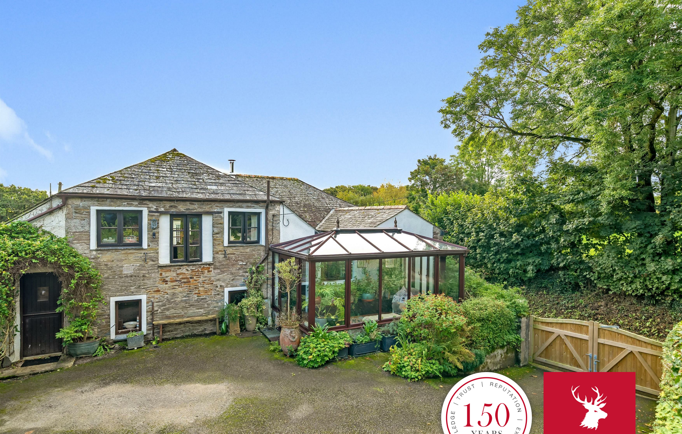
The Coach House