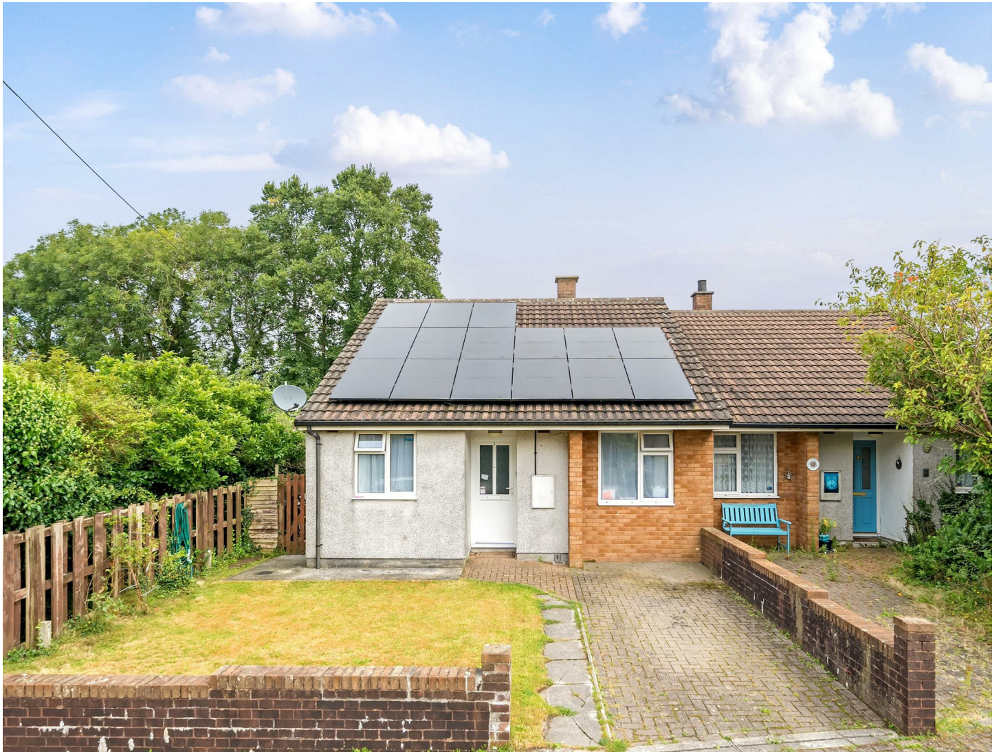
1 Tretawn Close