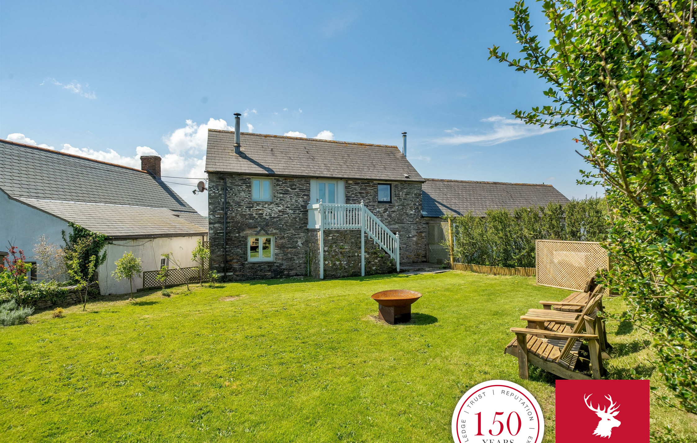
2, Penkear Cottages