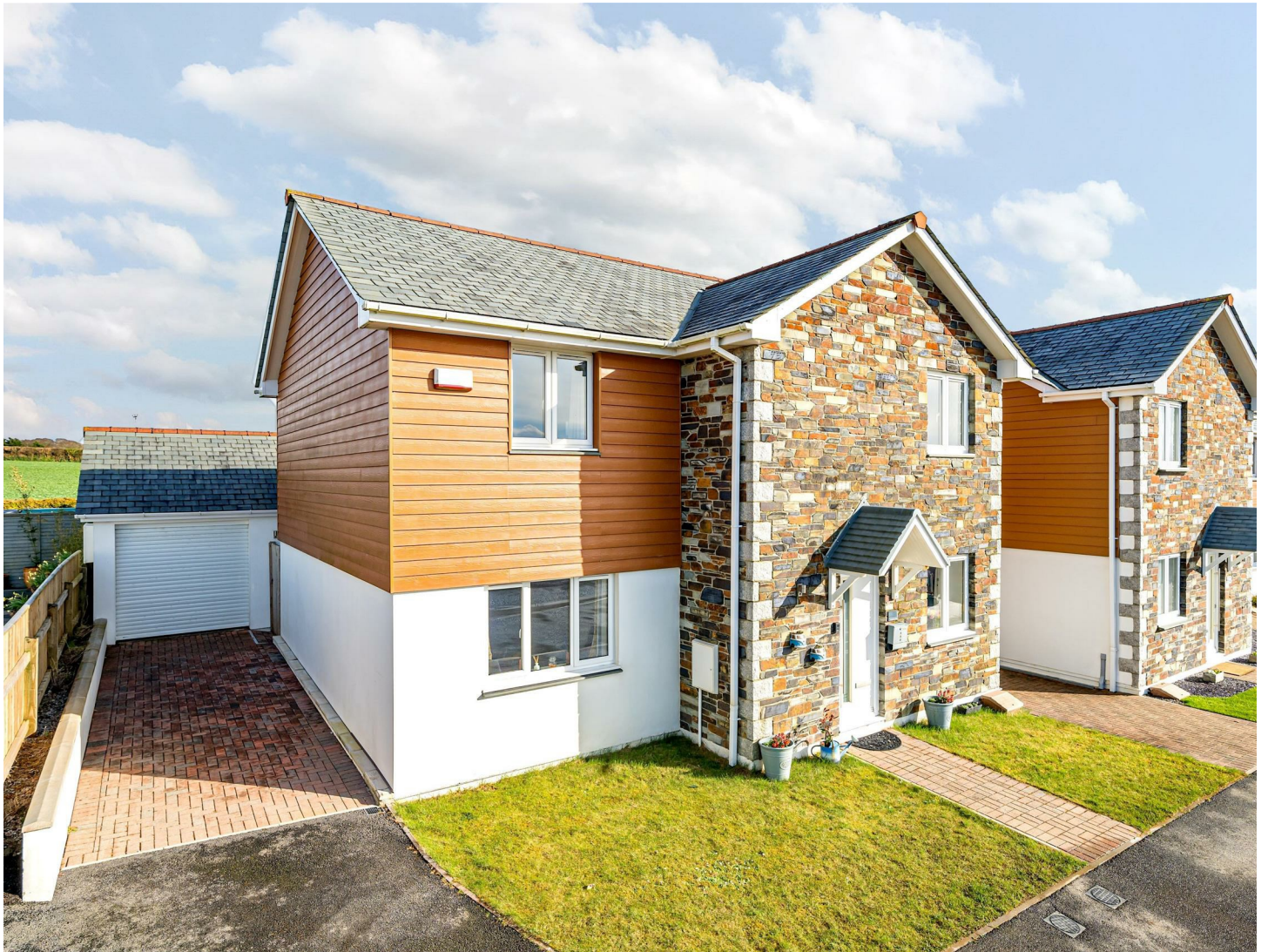
1 Longstone View