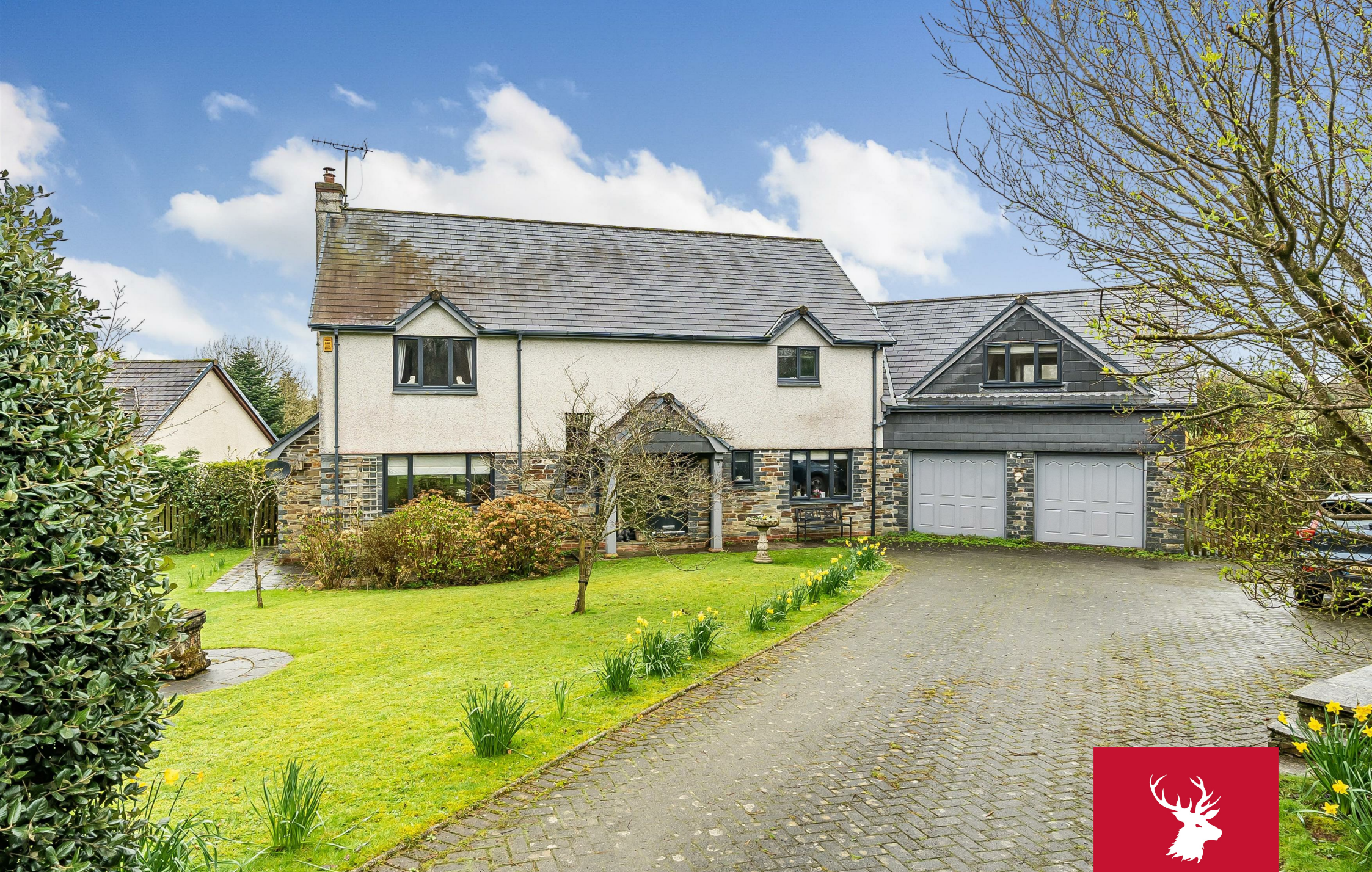
3, Bowood Park