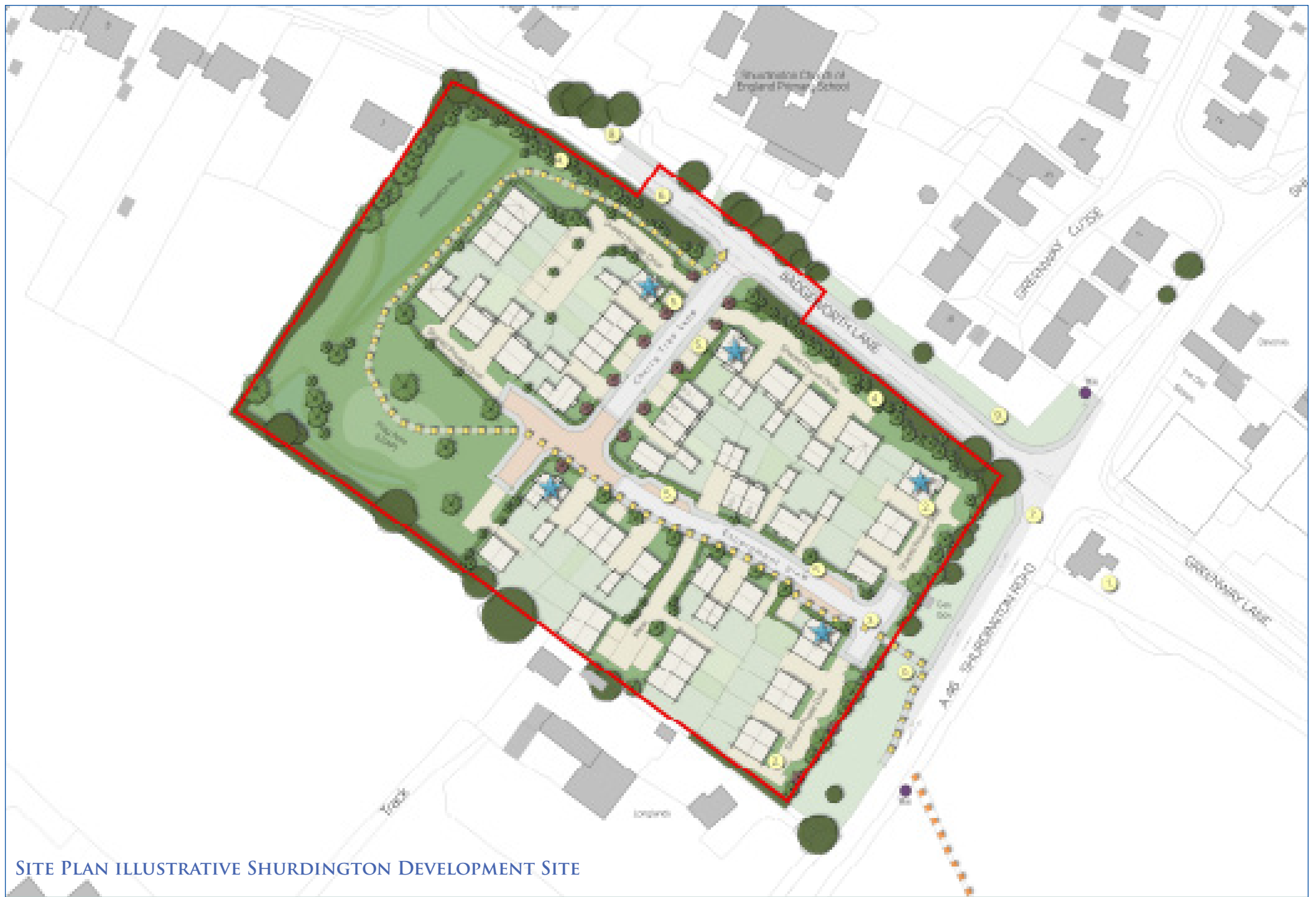
SITE PLAN ILLUSTRATIVE SHURDINGTON DEVELOPMENT SITE