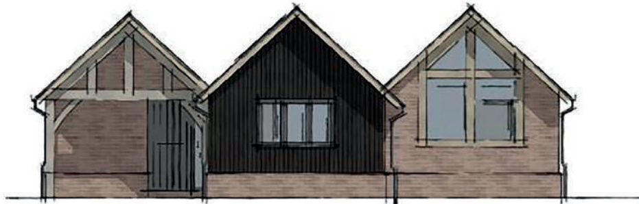
FRONT (NORTH-EAST ELEVATION)