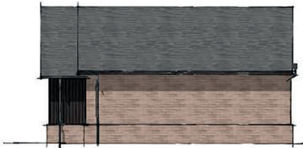
SIDE (NORTH-WEST ELEVATION)