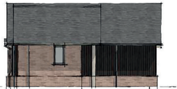
SIDE (SOUTH-EAST ELEVATION)