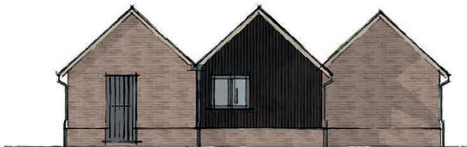
REAR (SOUTH-WEST ELEVATION)