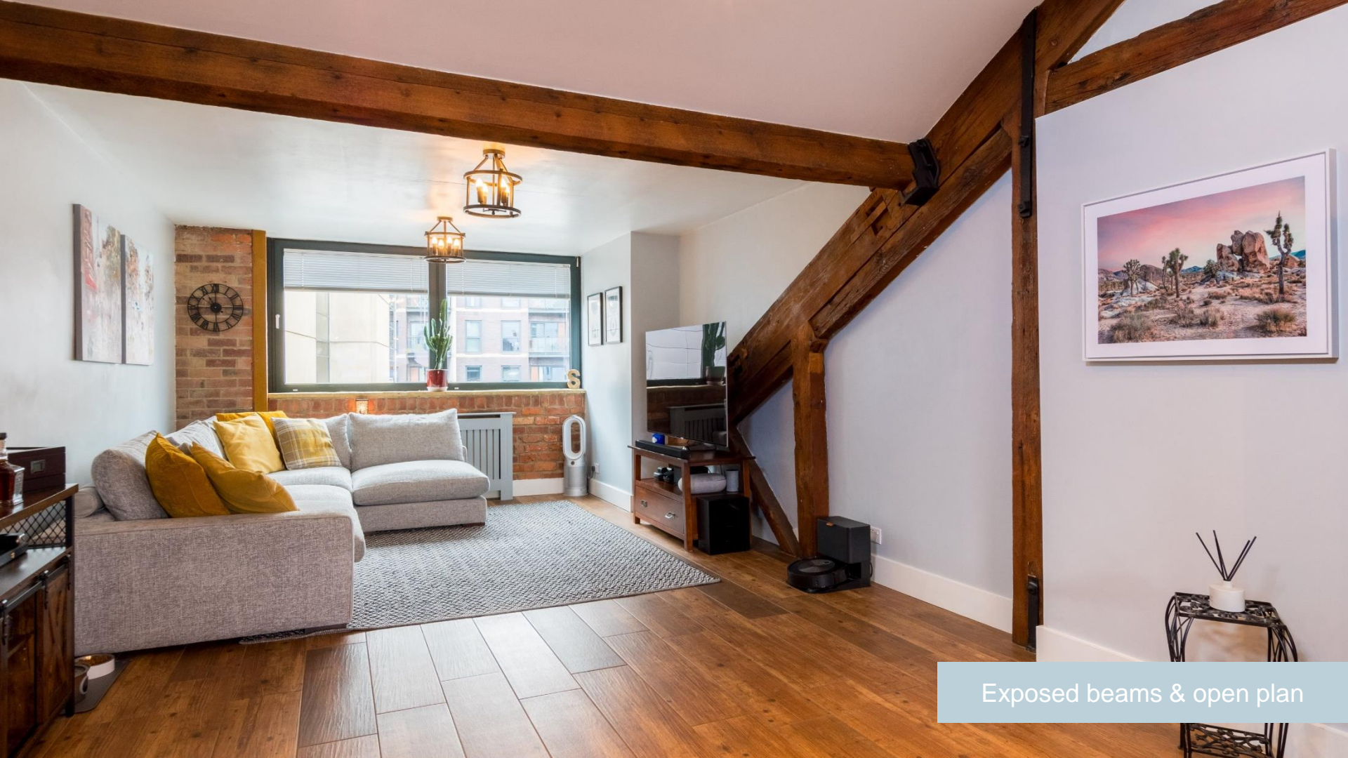
Exposed beams & open plan