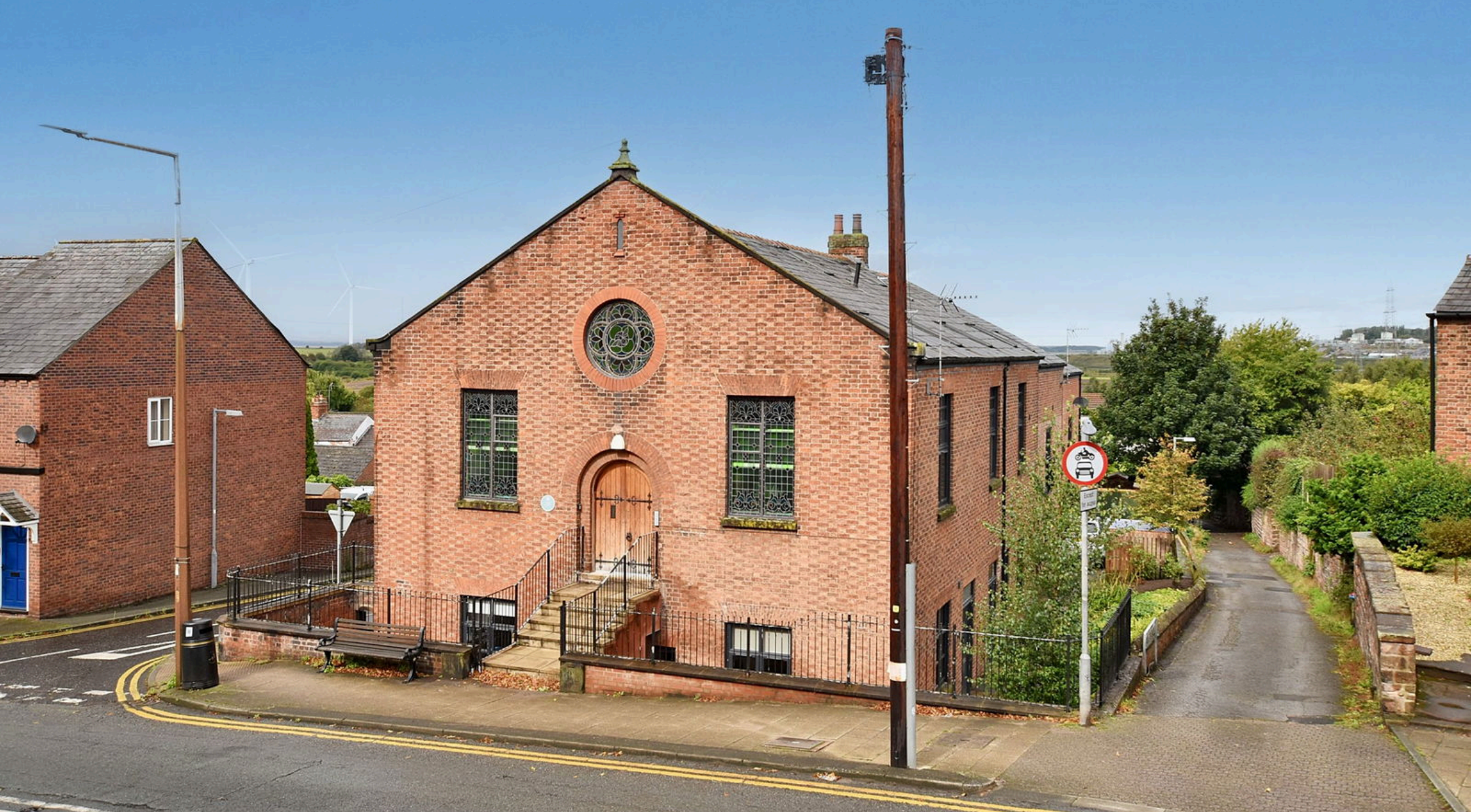
Old Library House, High Street, Frodsham, Cheshire