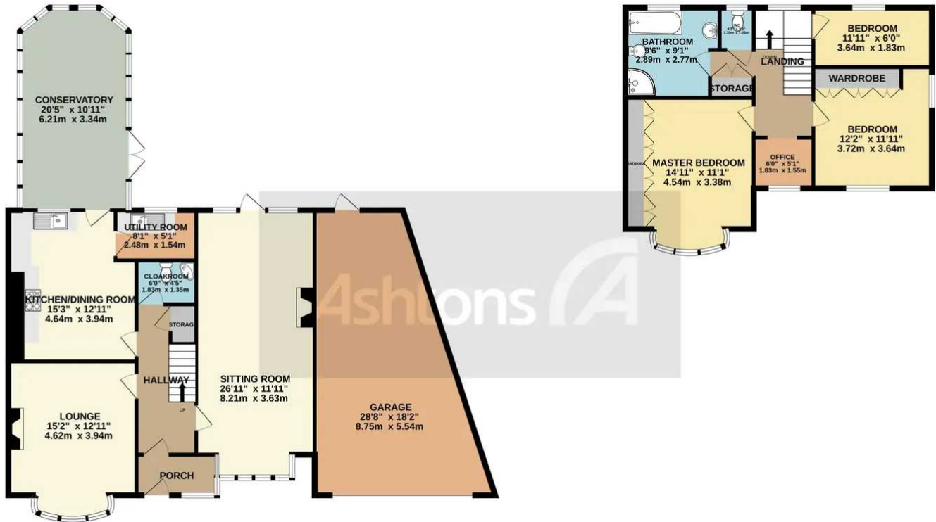
TOTAL FLOOR AREA : 2089 sq.ft. (194.1 sq.m.) approx.

Whilst every attempt has been made to ensure the accuracy of the floorplan contained here, measurements of doors, windows, rooms and any other items are approximate and no responsibility is taken for any error, omission or mis-statement. This plan is for illustrative purposes only and should be used as such by any prospective purchaser. The services, systems and appliances shown have not been tested and no guarantee as to their operability or efficiency can be given. Made with Metropix ©2023