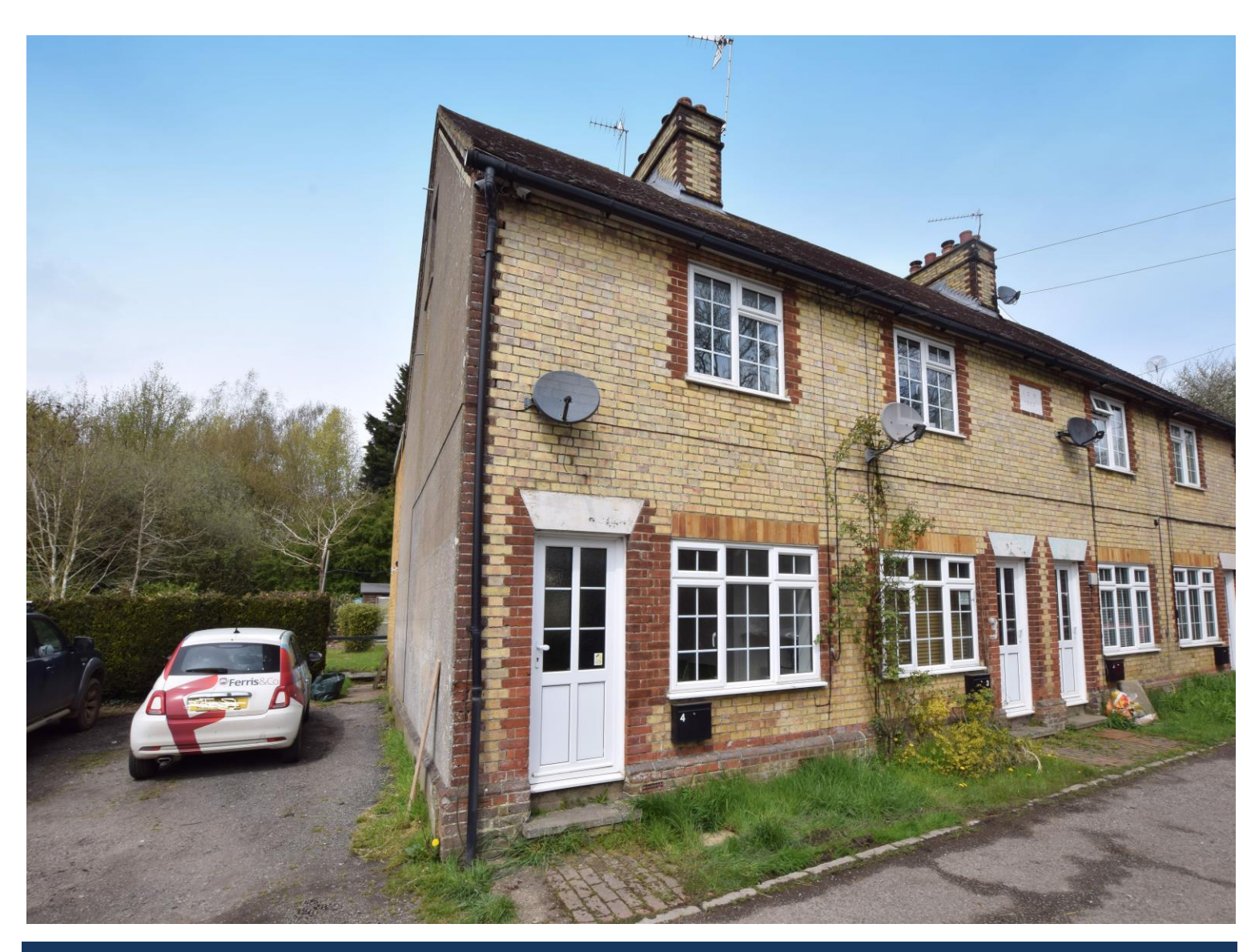
£1400 pcm Holding deposit equivalent to 1 week's rent on application