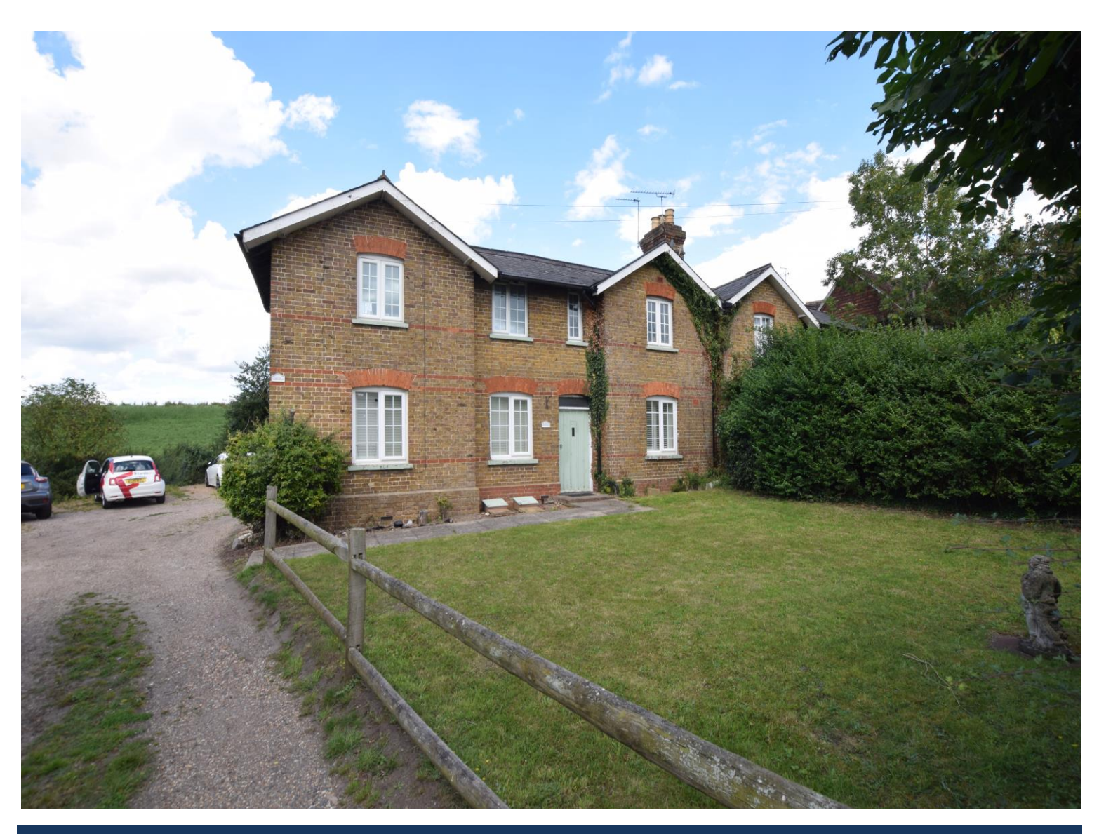
£1125 pcm – ALL BILLS INCLUDED Holding deposit equivalent to 1 week's rent on application