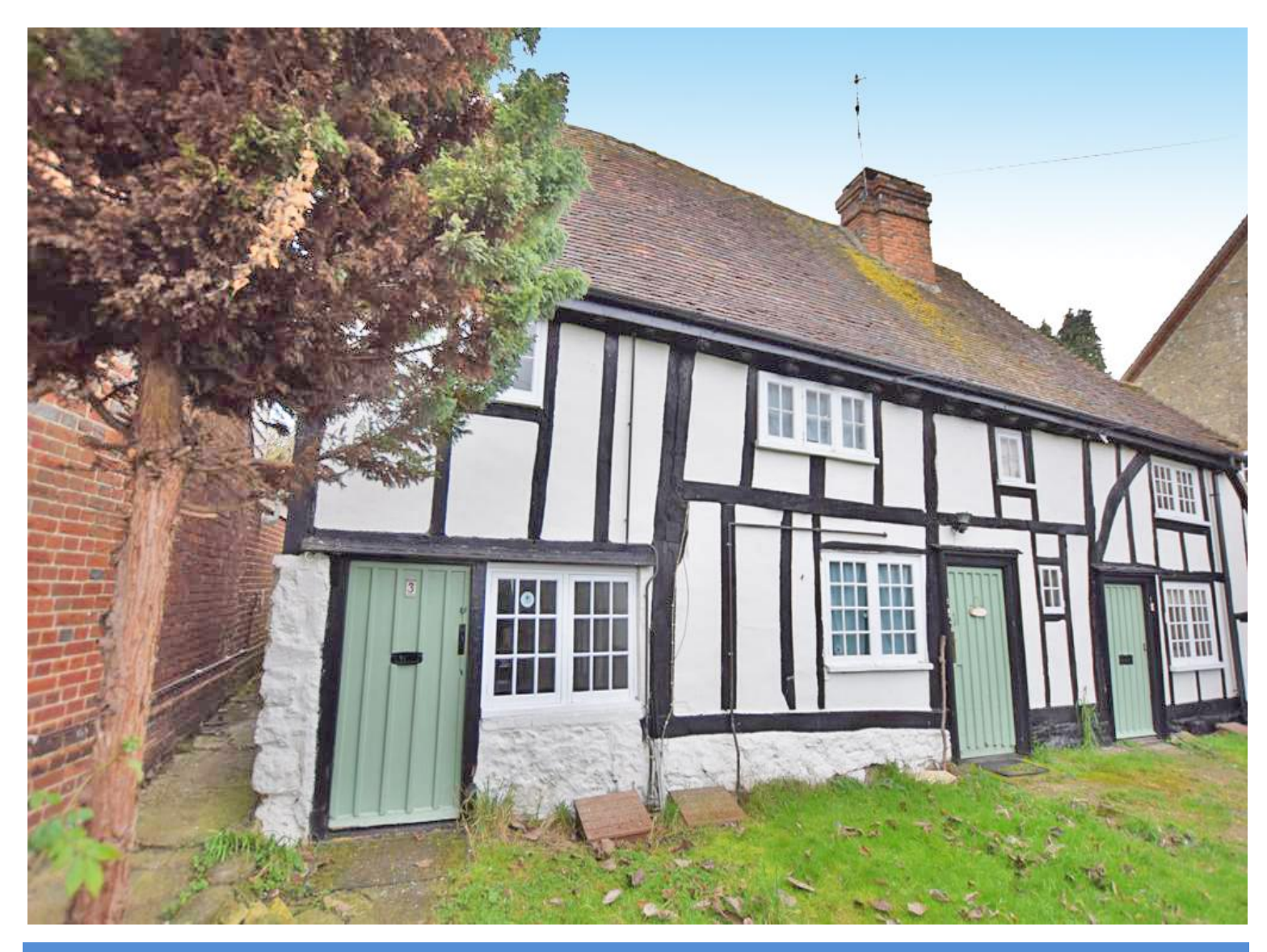
£995.00 PCM Holding deposit equivalent to 1 weeks rent on application