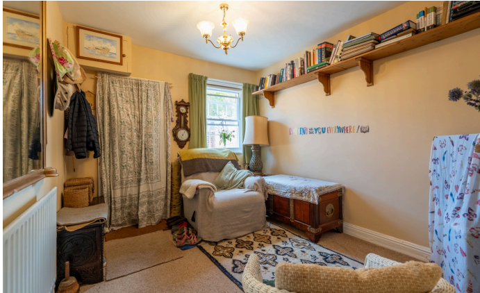
Living Room 3.47m x 2.72m (11' 5" x 8' 11")