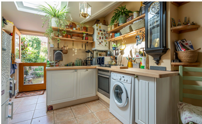
Kitchen/Diner 4.45m x 2.73m (14' 7" x 8' 11")