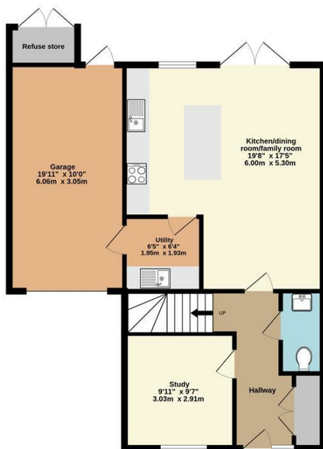
Ground Floor 802 sq.ft. (74.5 sq.m.) approx.