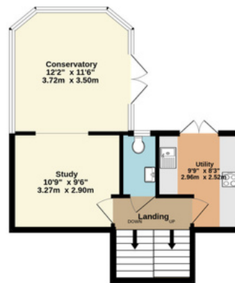
1st Floor 397 sq.ft. (36.9 sq.m.) approx.