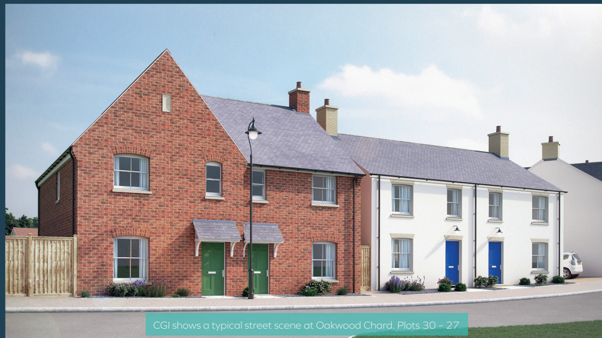
CGI shows a typical street scene at Oakwood Chard. Plots 30 - 27