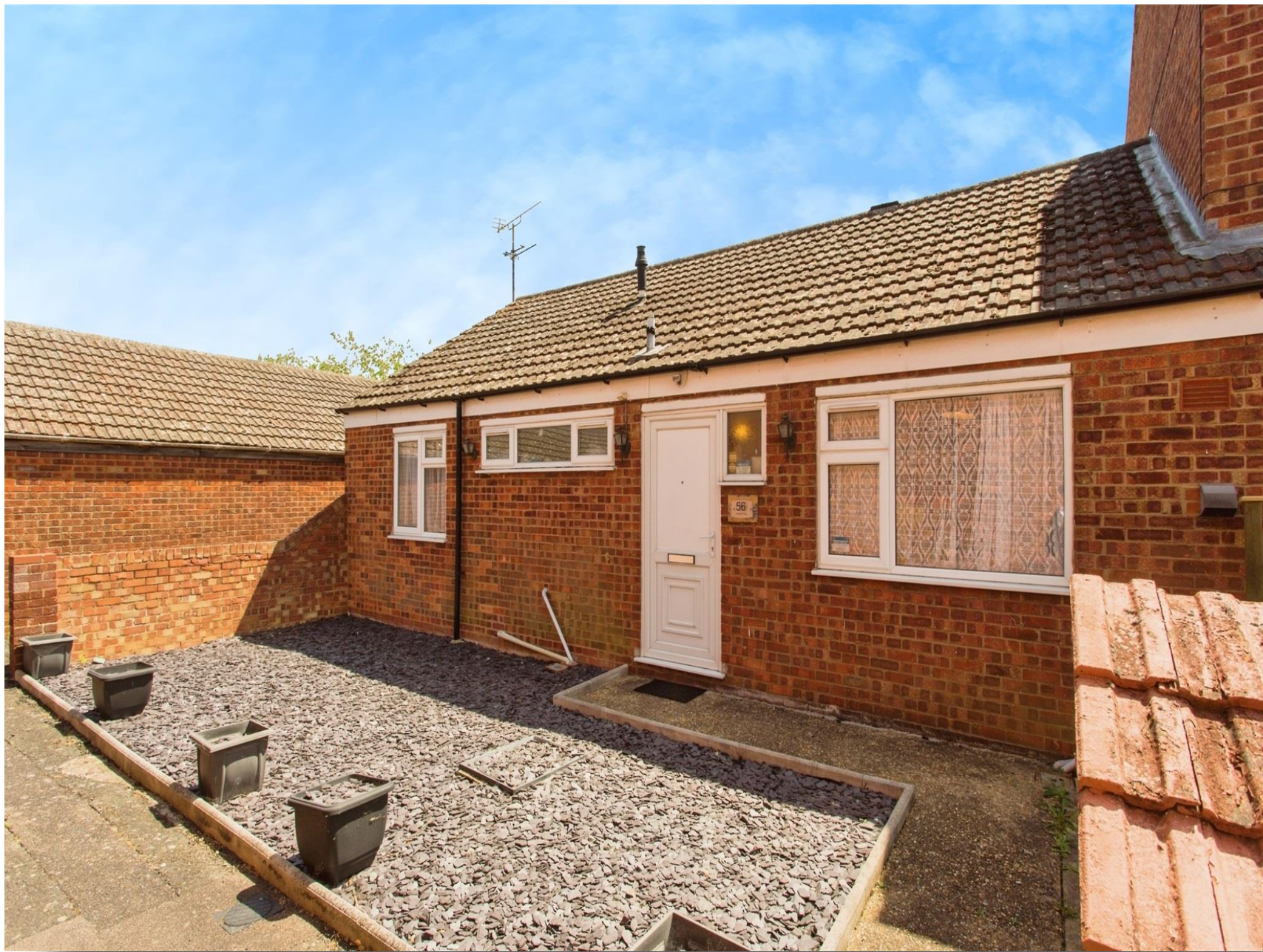
Vincent Close, Newmarket CB8 7AN