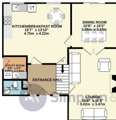
GROUND FLOOR 905 sq.ft. (84.1 sq.m.) approx.