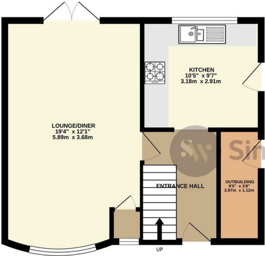
GROUND FLOOR 440 sq.ft. (40.9 sq.m.) approx.