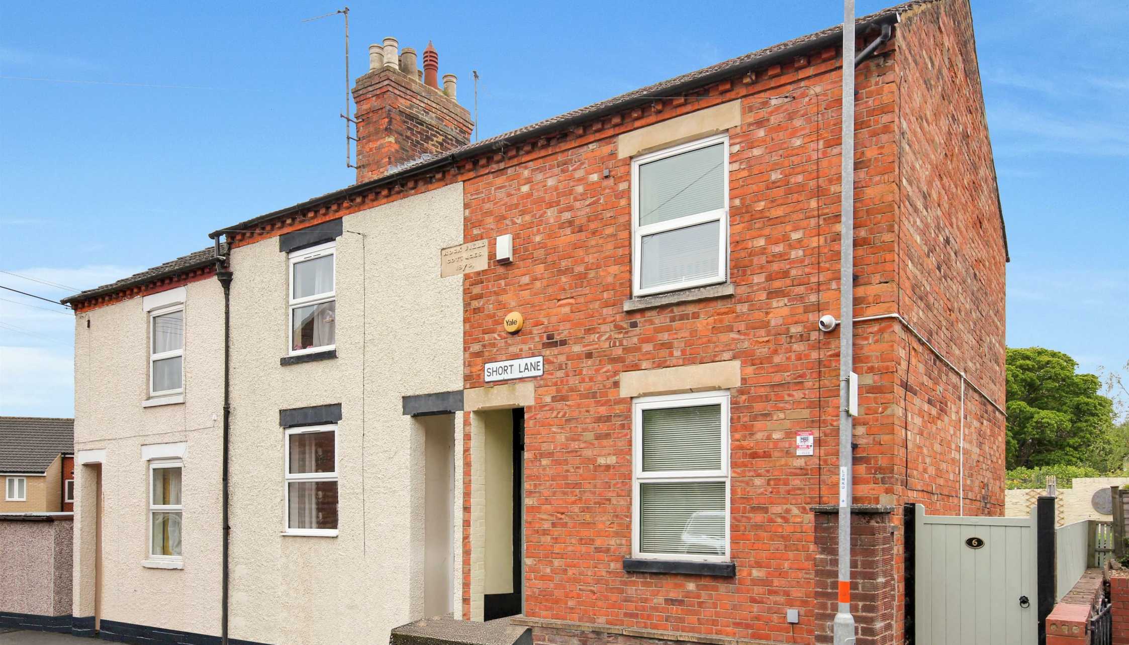
6 Short Lane Wellingborough, NN8 4LP