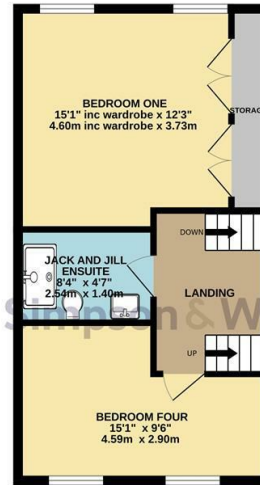
1ST FLOOR 431 sq.ft. (40.0 sq.m.) approx.