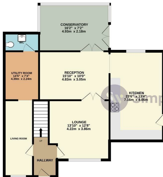
GROUND FLOOR 963 sq.ft. (89.5 sq.m.) approx.