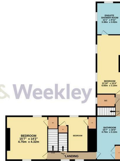
1ST FLOOR 1062 sq. ft. (98.7 sq. m.) approx.