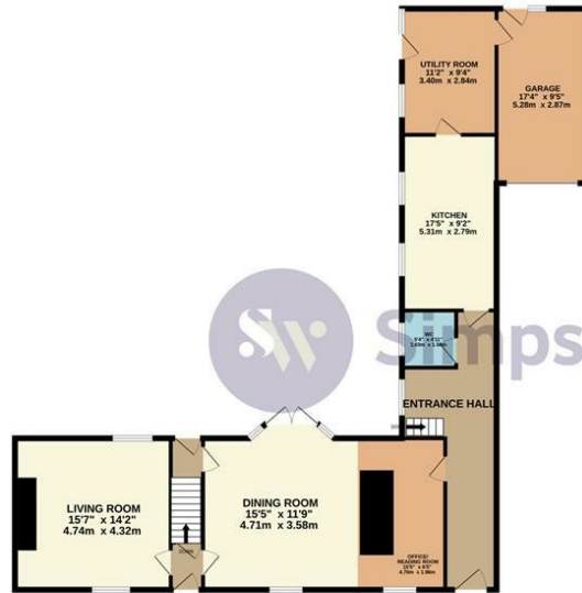
GROUND FLOOR 1260 sq. ft. (117.0 sq. m.) approx.