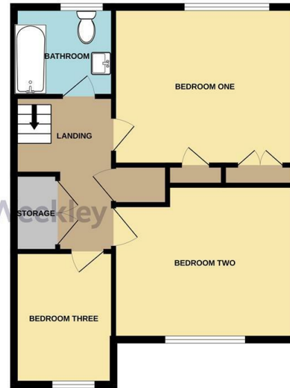
1ST FLOOR 375 sq.ft. (34.8 sq.m.) approx.