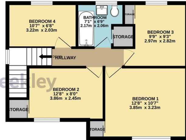
1ST FLOOR 527 sq.ft. (49.0 sq.m.) approx.