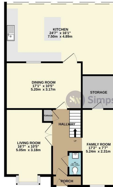
GROUND FLOOR 987 sq.ft. (91.7 sq.m.) approx.