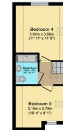
Second Floor Floor area 27.0 sq.m. (291 sq.ft.)

Total floor area: 367.5 sq.m. (3,955 sq.ft.)