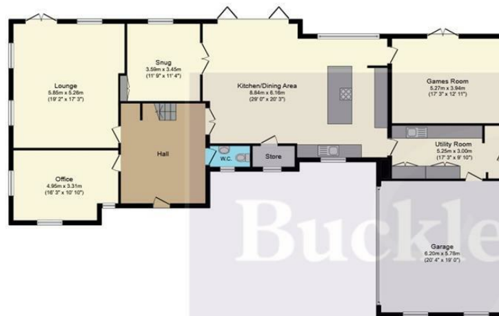
Ground Floor Floor area 205.5 sq.m. (2,212 sq.ft.)