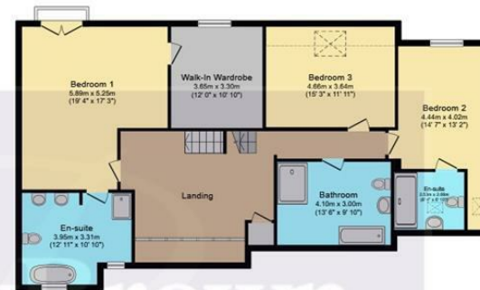
First Floor Floor area 134.9 sq.m. (1,452 sq.ft.)