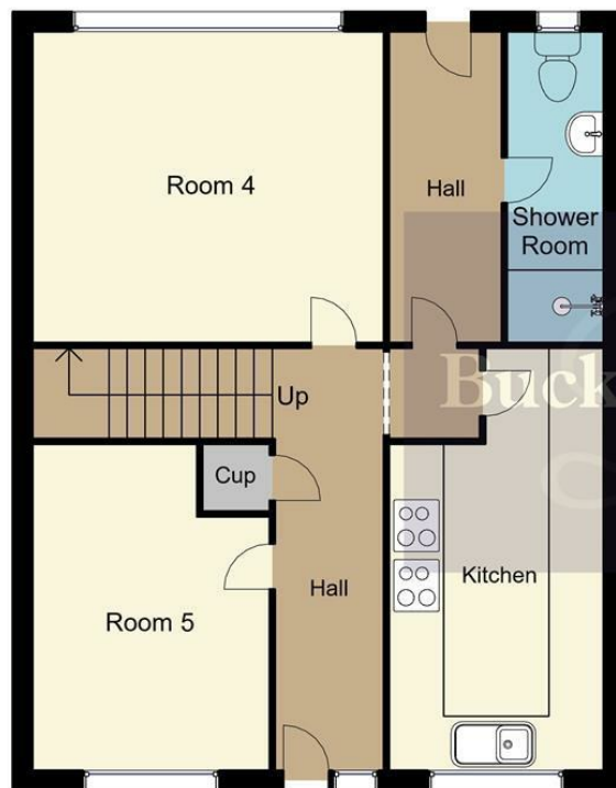
Ground Floor 58 Sq.m/622.27 Sq.ft Approx