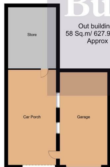
Out buildings 58 Sq.m/ 627.91 Sq.ft Approx

Whilst every attempt has been made to ensure the accuracy of the floor plan contained here, no responsibility is taken for incorrect measurements of doors, windows, appliances and room or any error, omission or misstatement. Exterior and interior walls are drawn to scale based on interior measurements. Any figure given is for initial guidance only and should not be relied on as basis of valuation. These plans are for marketing purposes only and should be used as such by any prospective purchase. Specially no guarantee is should not be relied on as a basis of valuation. These plans are for marketing purposes only and should be used as such by any prospective purchase. Specifically no guarantee is given on the total square footage of the property if quoted on this plan.