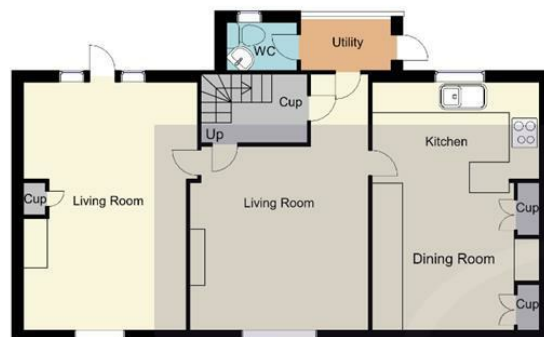
Ground Floor 60 Sq.m/ 649.79 Sq.ft Approx