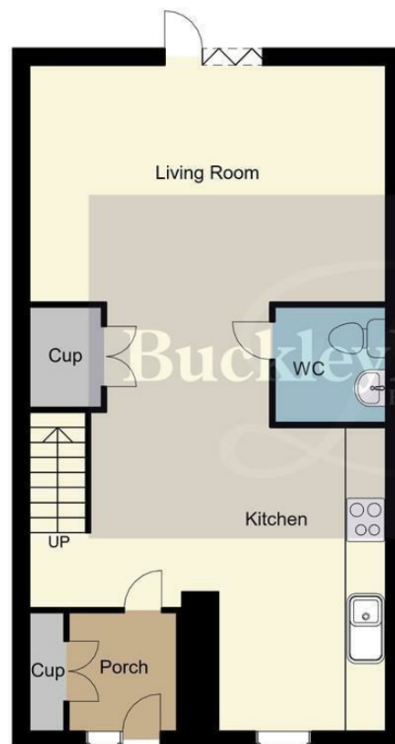
Ground Floor 48sq.m/517.98sq.ft Approx.