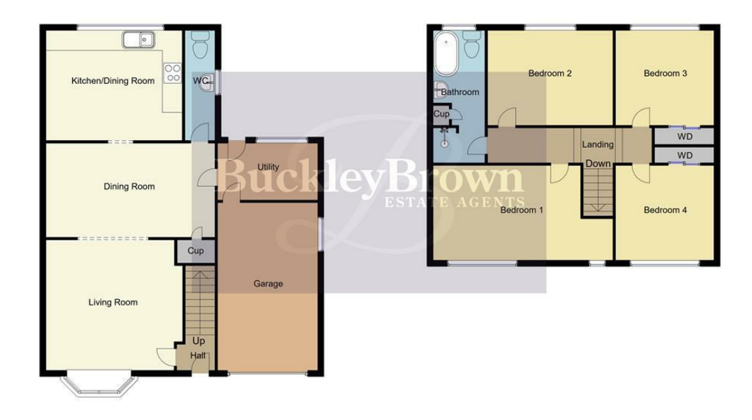
First Floor 56 Sq.mt / 602.77 Sq.ft Approx

Whilst every attempt has been made to ensure the accuracy of the floor plan contained here, no responsibility is taken for incorrect measurements of doors, windows, appliances and room or any error, omission or misstatement. Exterior and interior walls are drawn to scale based on interior measurements. Any figure given is for initial guidance only and should not be relied on as basis of valuation. These plans are for marketing purposes only and should be used as such by any prospective purchase. Specially no guarantee is should not be relied on as a basis of valuation. These plans are for marketing purposes only and should be used as such by any prospective purchase. Specifically no guarantee is given on the total square footage of the property if quoted on this plan. CC Ltd @2018