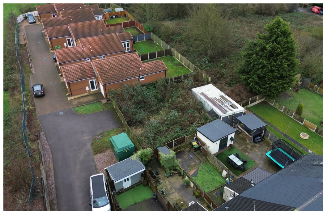
Gross Development Value Our helpful negotiators will be more than happy to discuss any potential income to be made on your purchase of this plot, with advice from our expert valuers.