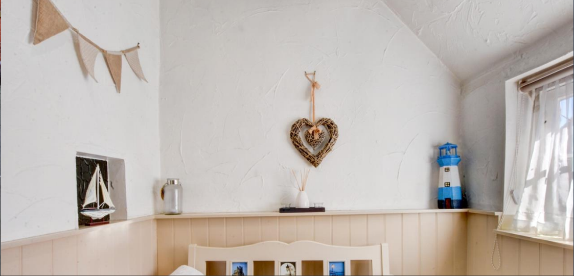
7 (THE COTTAGE), WARDS YARD, BAXTERGATE, WHITBY Guide Price £235,000