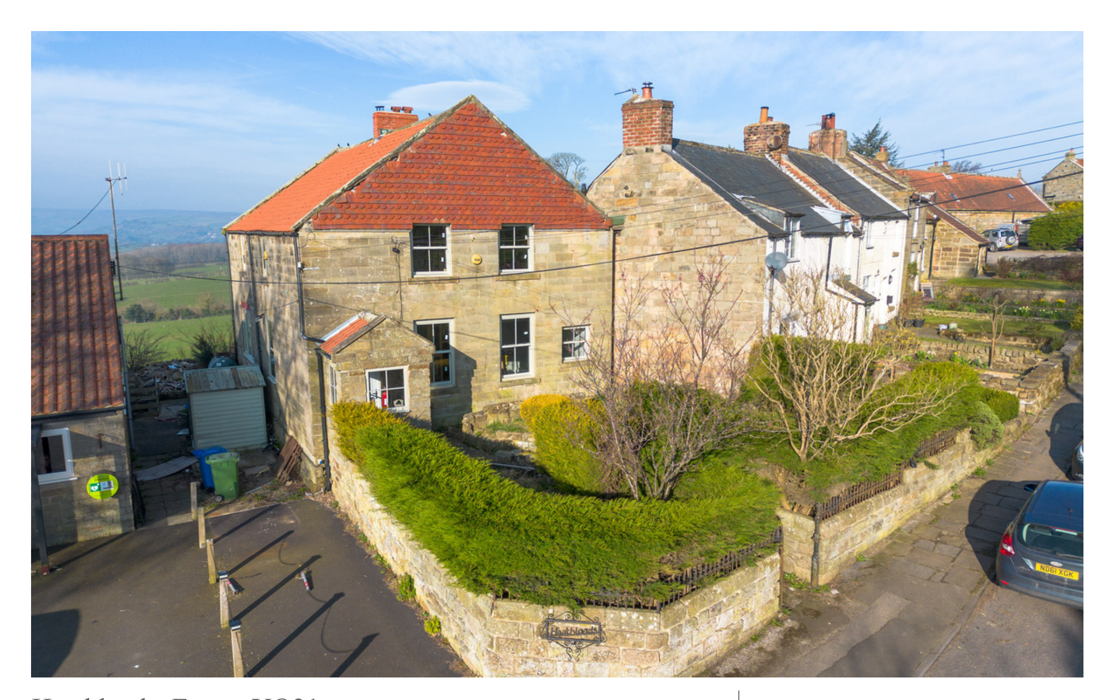
Heathlands, Egton, YO21 £365,000