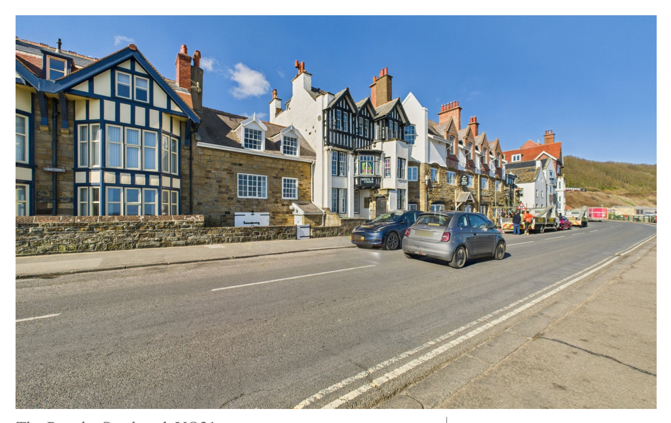
The Parade, Sandsend, YO21 Guide Price £295,000