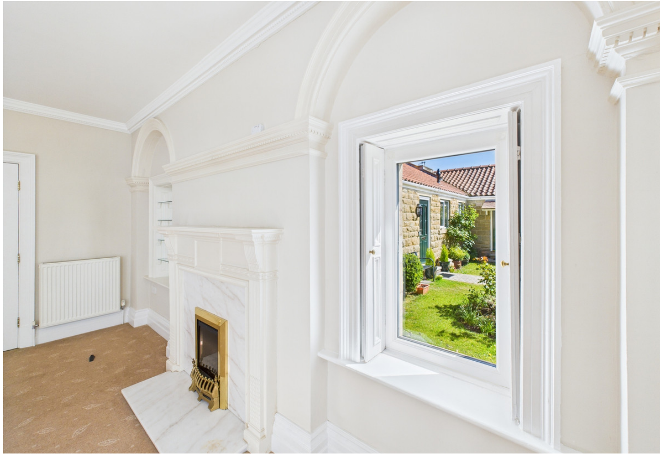
Coach Road, Sleights. Hendersons introduce Apartment 1, Sleights Hall, a ground floor sanctuary nestled within the historic confines of Sleights Hall.