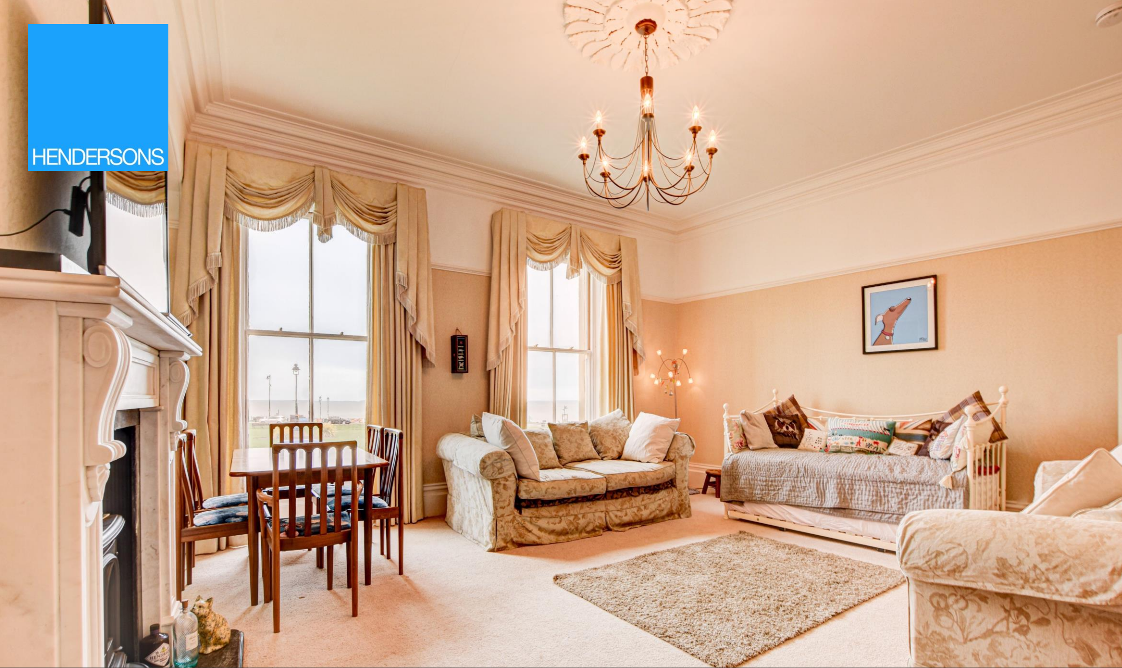
FLAT 1, 11 ROYAL CRESCENT, ROYAL CRESCENT, WHITBY Guide Price £250,000