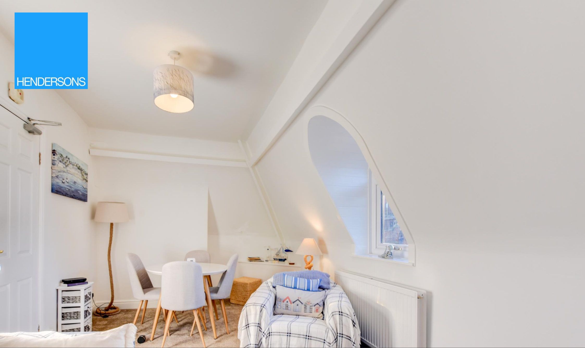
FLAT 5, 9 BROOMFIELD TERRACE, WHITBY Guide Price £130,000