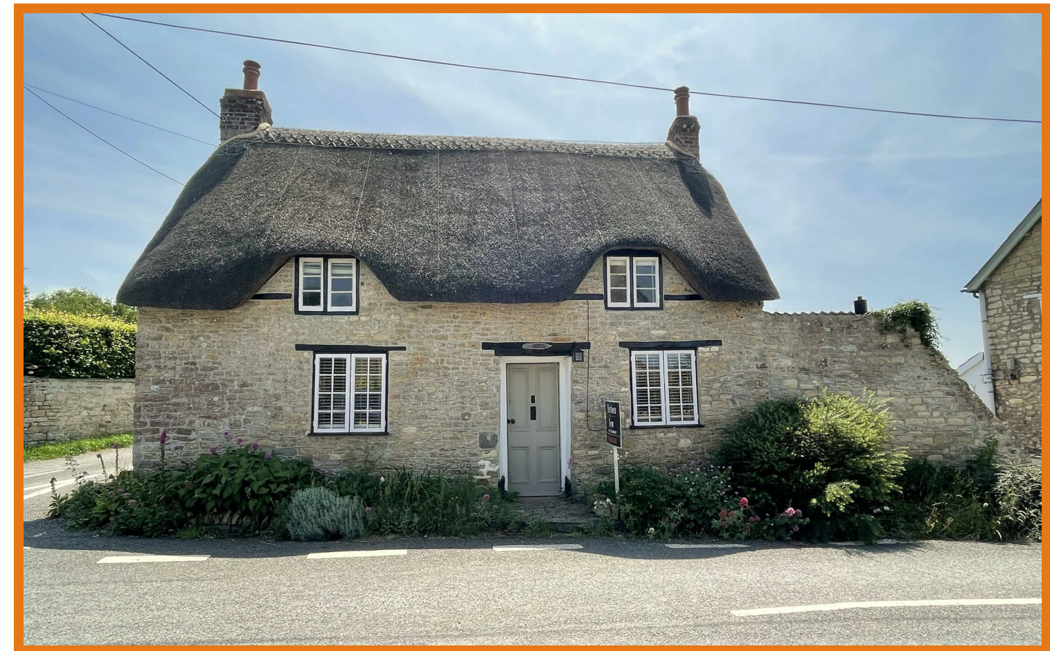
Mill Lane Stour Provost