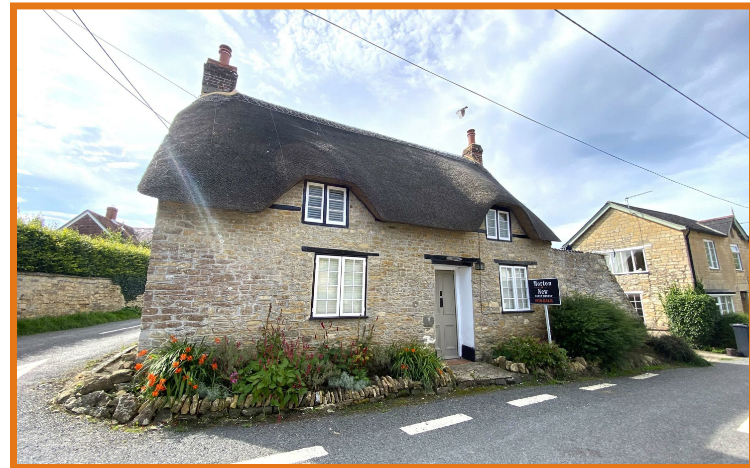
Mill Lane Stour Provost

t. 01747 824 547 gillingham@mortonnew.co.uk www.mortonnew.co.uk