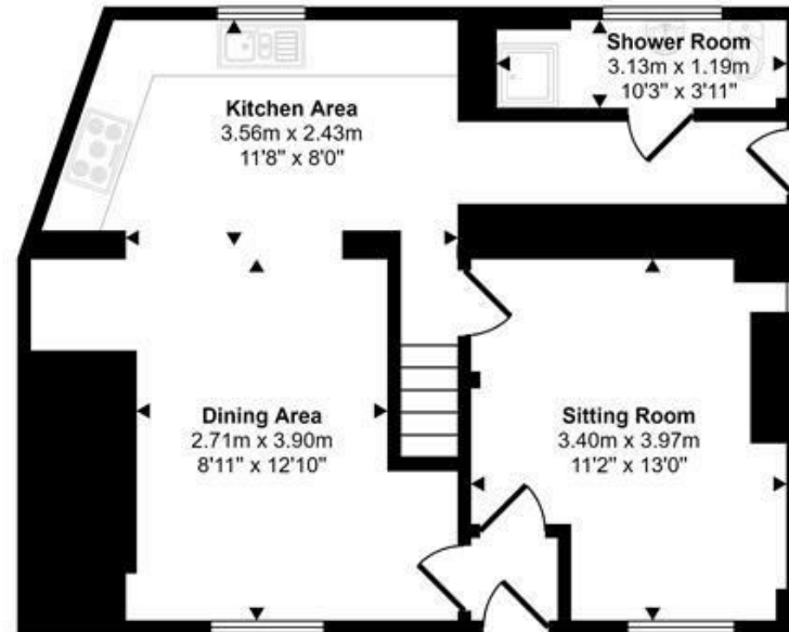
Ground Floor Approx 51 sq m / 550 sq ft

Approx Gross Internal Area 94 sq m / 1015 sq ft