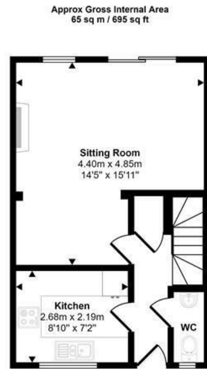
Ground Floor Approx 32 sq m / 348 sq ft