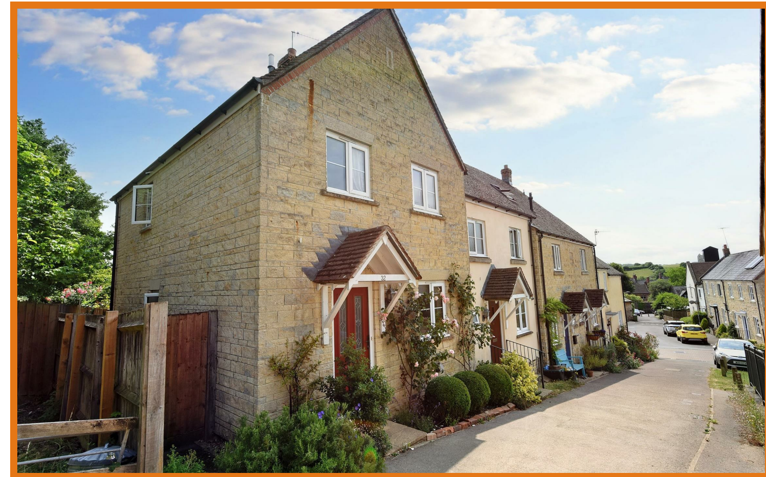
Tolbury Mill Bruton