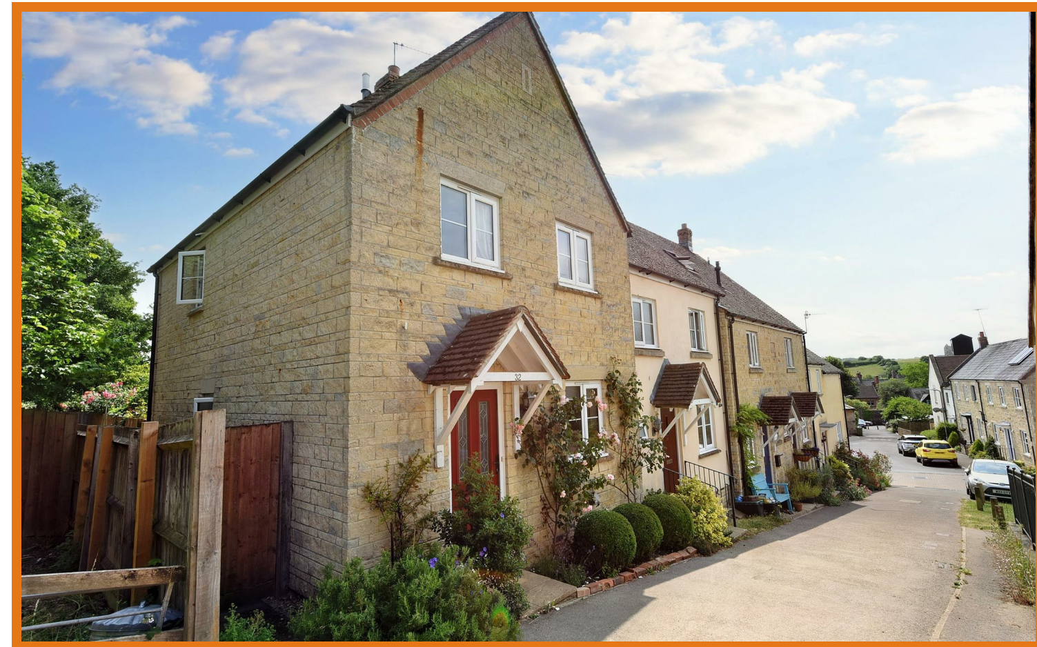
Tolbury Mill Bruton